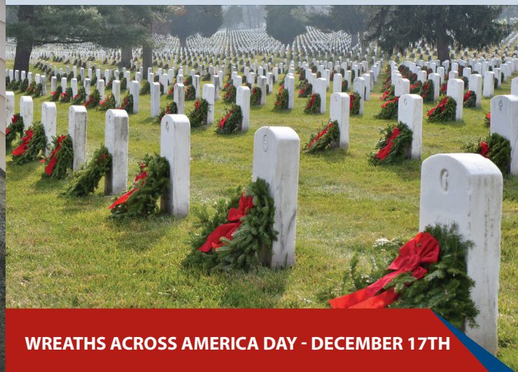
WREATHS ACROSS AMERICA DAY - DECEMBER 17TH