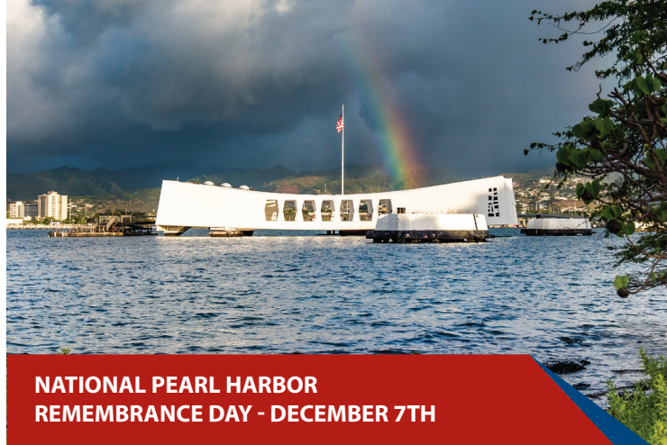
NATIONAL PEARL HARBOR REMEMBRANCE DAY - DECEMBER 7TH

Come into the Housing Office on December 16th from 2:00 PM to 4:00 PM for some hot cocoa and cookies while making a mini gingerbread house! Santa will be here for photos and be sure to bring those letters to drop in Santa's Mailbox. This event is for residents only.